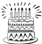
A Special Birthday

The happy grandparents are in Florida enjoying this new baby and caring for the family.